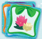
42 Present Tiles