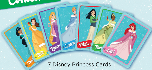
7 Disney Princess Cards